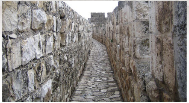
View of Jerusalem

I said to myself: "redemption will come only if their guide tells them, 'You see that arch from the Roman period? It's not important: but next to it, left down and a bit, there sits a man who's bought fruit and vegetables for his family.'"